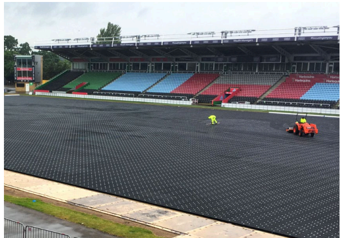
Temporary "Big Stadium Hockey" event (UK)