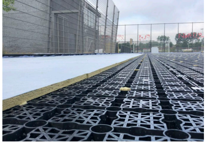
Football Club VVA Spartaan, Amsterdam