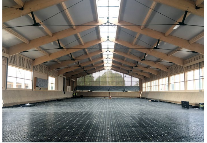
Indoor Equestrian Arena, Cranmore Farm (UK)