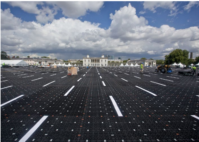
Greenwich Park, London Olympics