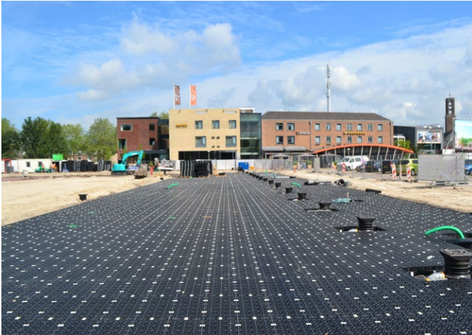
De Deel, Emmeloord