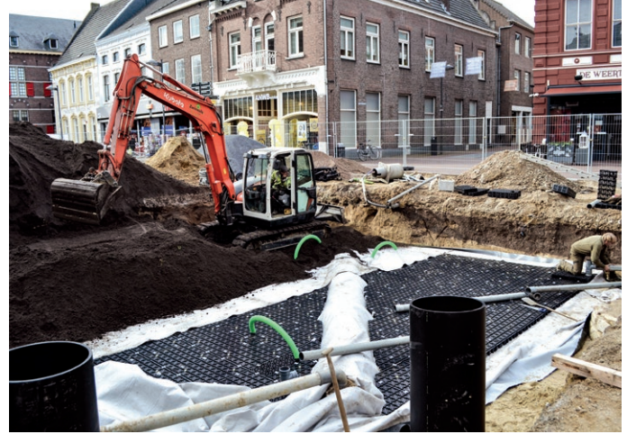
Oude Markt, Weert