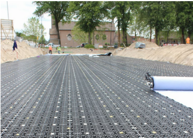
De Deel, Emmeloord