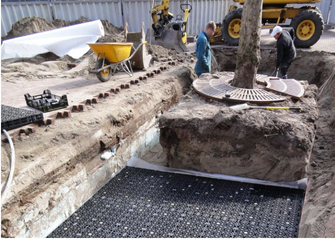
City Center, Eindhoven