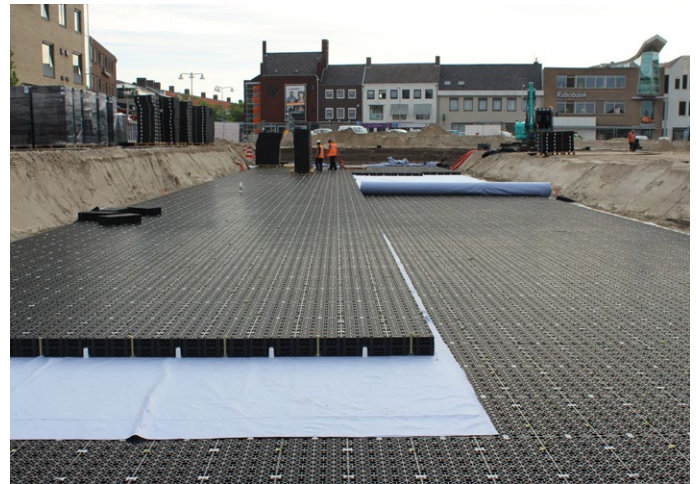
De Deel, Emmeloord