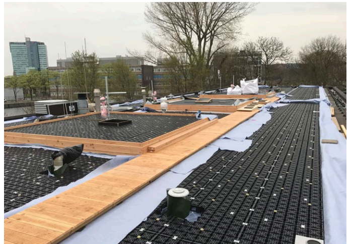
Project SmartRoof 2.0, Amsterdam