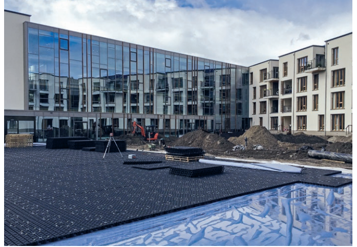
Project Margareta, Kampen