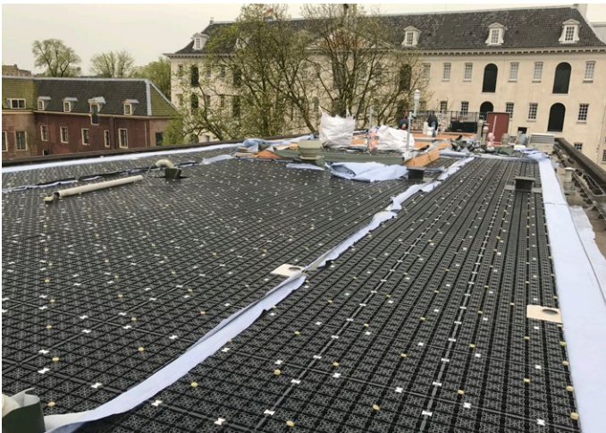
Project SmartRoof 2.0, Amsterdam