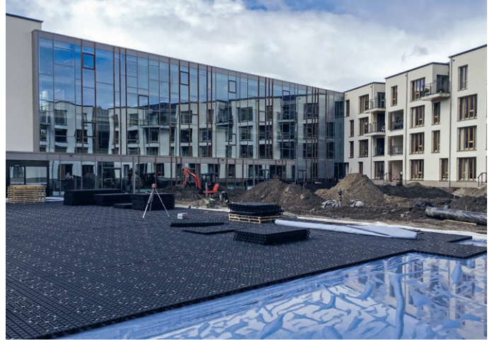
Project Margareta, Kampen